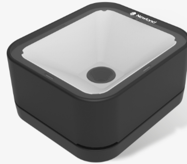
FR27 Urchin stationary scanners